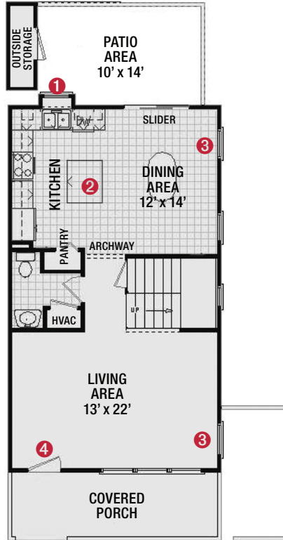
1ST FLOOR: 680 SQ. FT. (both interior and end units)