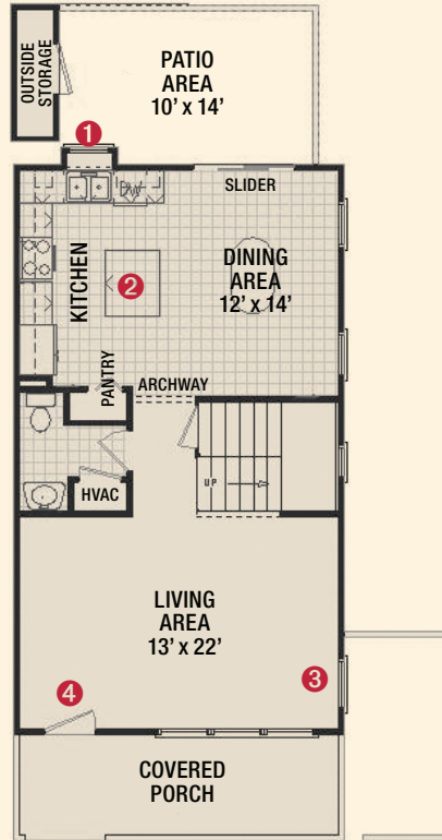
1ST FLOOR: 680 SQ. FT. (both interior and end units)